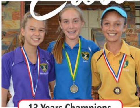
13 Years Champions