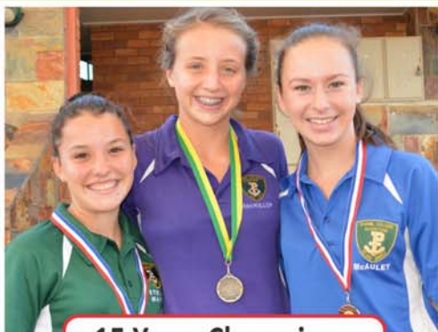
15 Years Champions