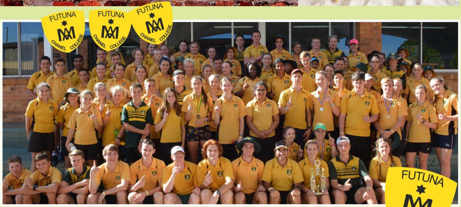
2016 CROSS COUNTRY HOUSE CHAMPIONS