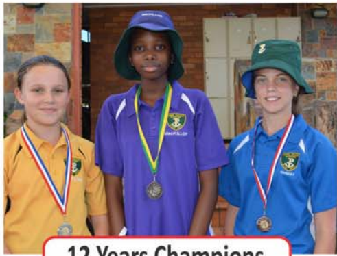
12 Years Champions