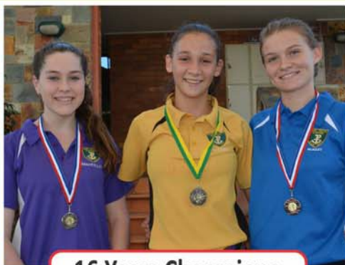
16 Years Champions