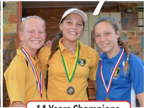
14 Years Champions